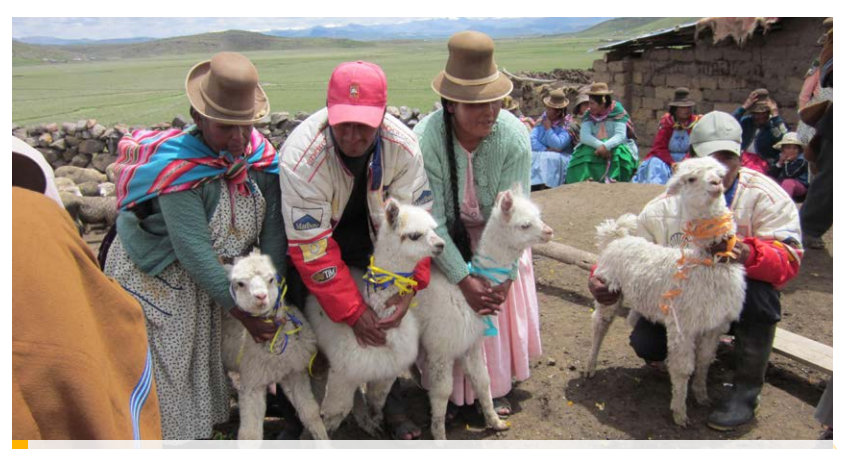
For indigenous peoples, such as these pastoralists in the south Peruvian Andes, the cultural aspect of food is of great importance.

All these issues come together in the lack of safeguards in the governance mechanism of the agroecology work in FAO to ensure a holistic, transformative approach. An important step would be to ensure some level of accountability of the actors who want to partner with FAO on agroecology under the Scaling Up Initiative. From this perspective, two important questions emerge: What