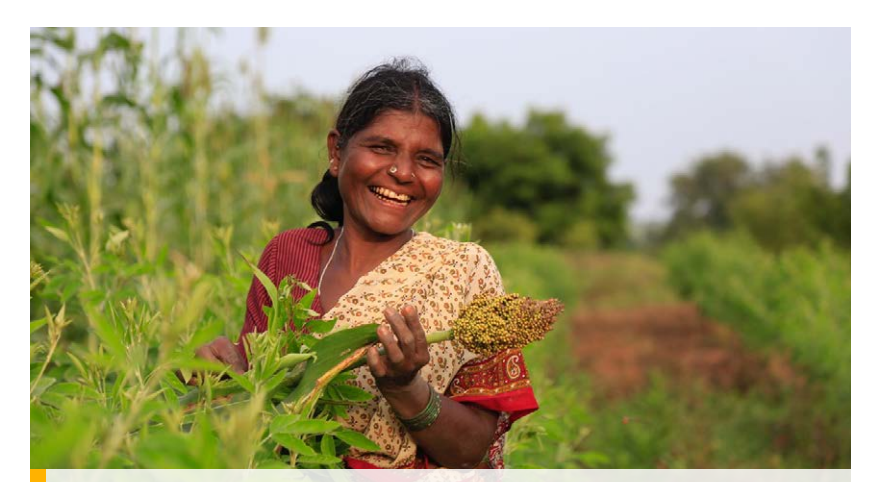
Growing millet, a nutritious traditional staple crop in India.