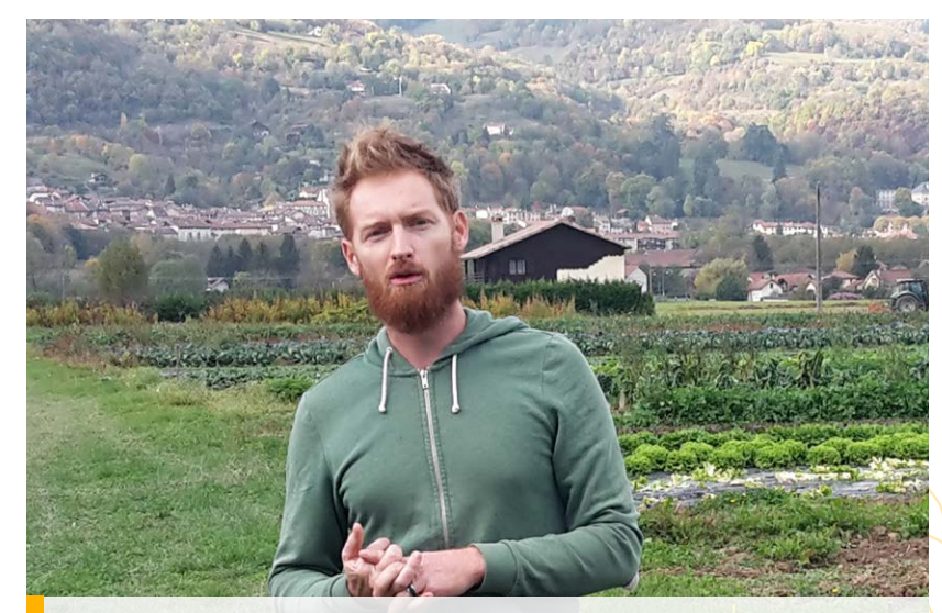
Atelier Paysan in France works with small scale farmers to develop appropriate tools and mechanisation.

Support documentation and horizontal (South-South) exchange of lessons learned in emblematic initiatives, specifically around civil society expertise and holistic approaches, while working closely with researchers who support rather than undermine or challenge the knowledge and leadership of food producers.